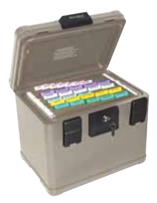
SS106 Holds letter and A4 size hanging file folders