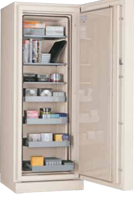
Safe shown with Composite Drawers and Fixed Shelves (sold separately).