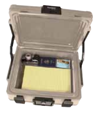
SS104 Holds letter and legal size files