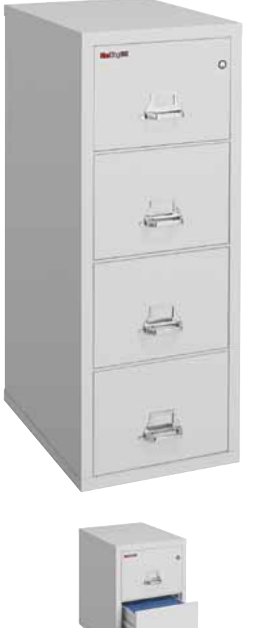
4-2125-C Legal size/Shown in Platinum